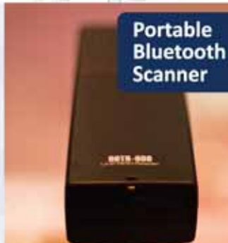
Portable Bluetooth Scanner